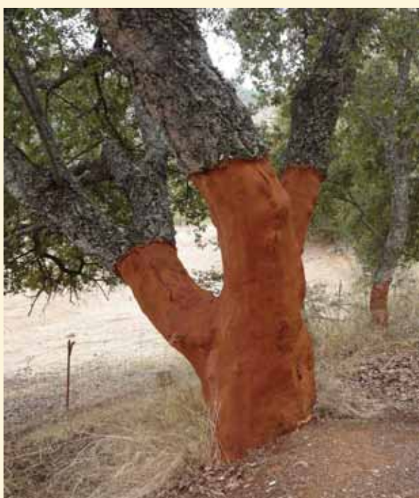
Cork oak tree after harvesting

Our last full day began early boarding jeeps and people carriers for our visit to the Doñaña national park. The greater Doñaña area is approximately triangular, stretching from Huelva in the west to Sevilla (Seville) in the east, and down to Sahlucar de Barrameda in the south. Our base was the small town of El Rocío, ideally placed near the centre of the triangle. The Doñaña national park area exhibits different habitats depending on the time of year, ranging from shallow lagoons to