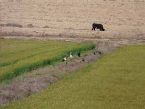
Laguna de la Landa, rice fields with stork and ibis

After a buffet lunch we hiked into the forest to view different bird species. Although most of the wild