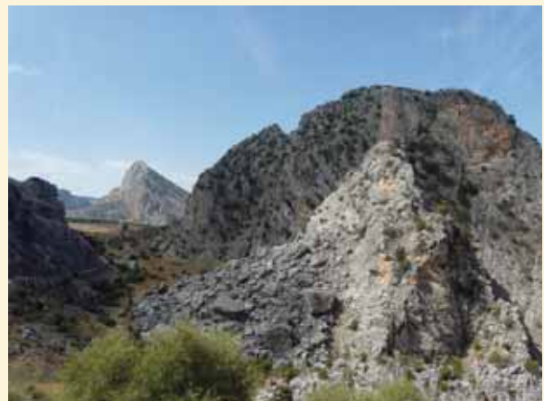
Rugged limestone Sierras in Andalucía near Ronda

The author had joined a party of experts on a 5-day tour of some of the best birdwatching sites in Andalucía. So in