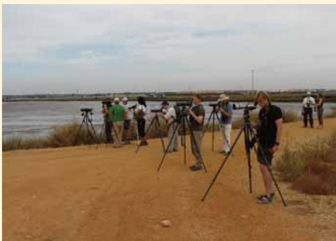
Marismas del Odiel, Huelva

These lagoons are a haven for water birds. As the tide ebbs and flows the birds are displaced from the coastal and estuarine areas and make their way to the lagoons where they can continue to feed. Our visit concluded with a visit to the spectacular spit of land that has formed at the Rio Tinto estuary, several kilometers long, with a road running its whole length. This area is popular for many