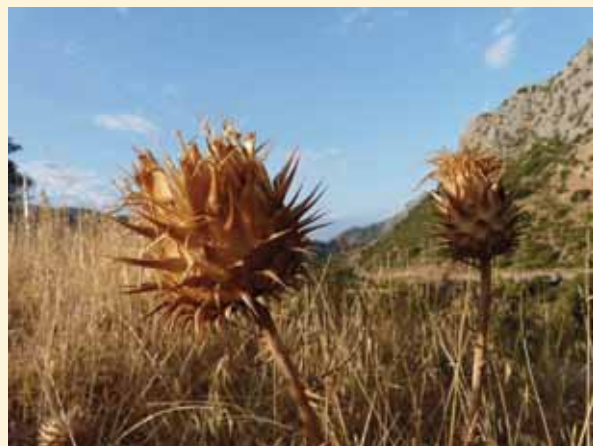
Late summer seed heads near the Cueva del Gato

Spain seems to be bursting with birds wherever you go, but not just the common or garden birds, instead there are many that would be considered exotic by someone raised in the UK. This was one of those rare occasions when you realize that there are places in the world, and not too far distant from our shores, where birdwatching