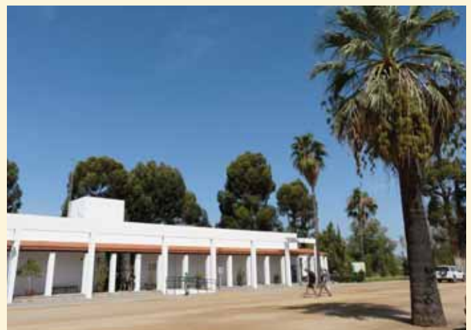
Visitor centre, Marismas del Odiel, Huelva