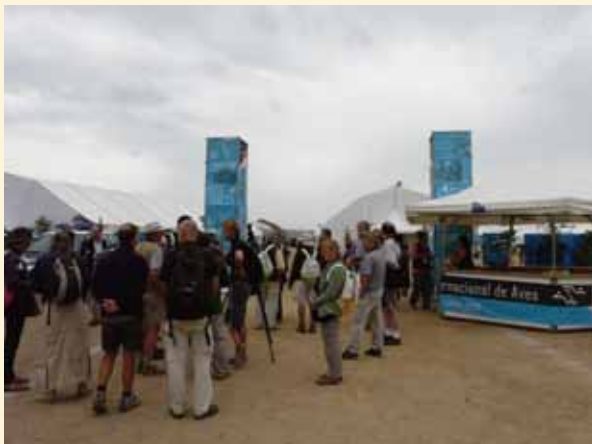
Visitors outside the 2008 Tarifa Bird Fair

We found interesting trade stands from different areas and providers of a wide range of outdoor activities, birdwatching predominated. Other regions of Spain were represented too. Being a major highway for migrating birds Spain offers a wide range of birdwatching destinations. There are national parks spread throughout the country, which one can visit at different times to see many other species. Equipment suppliers had special offers on a range of spotting scopes, binoculars, accessories and photographic equipment. There was much discussion about the finer points of equipment in general amongst the adherents to particular brands. Something that is always a hot topic of discussion.