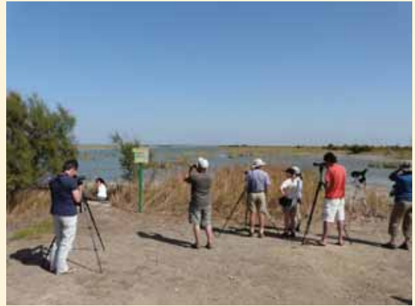
Donaña National Park - wetland area

parched baked clay as the summer weather dries up the water. Some patches of water remain all the year round and at times these are simply teeming with birds. At one time the whole Donaña area was a vast delta of the Guadalquivir river, but over time this gradually filled with sediments and formed first a shallow lagoon and now marshes. The whole area is therefore very flat. Donaña national park is home to the Iberian Lynx, a shy predator that we hoped to see. Unfortunately this was not to be, but our guides reported that it had been seen on numerous occasions. We did find wild boars. Here, in the Donaña national park we observed the Spanish Imperial Eagle to the obvious delight of the whole party. After an open air lunch served close to a former royal palace and hunting lodge we moved to one of the remaining wetland areas close to the Donaña visitor centre. The centre itself is named after Antonio Valverde whose vision and foresight ensured that the area was not drained for agricultural use. En route we passed carrion that was attracting a large number of large bird species including Griffon Vultures that circled overhead on the thermals. As the season was well advanced there were not many wet areas. This meant that on the remaining water there were large numbers of different bird species, together with