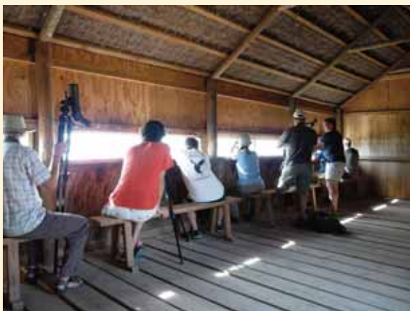
Inside birdwatching hide, Laguna de la Landa