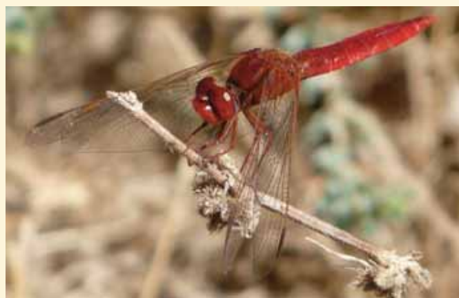
Dragonfly Donaña National Park