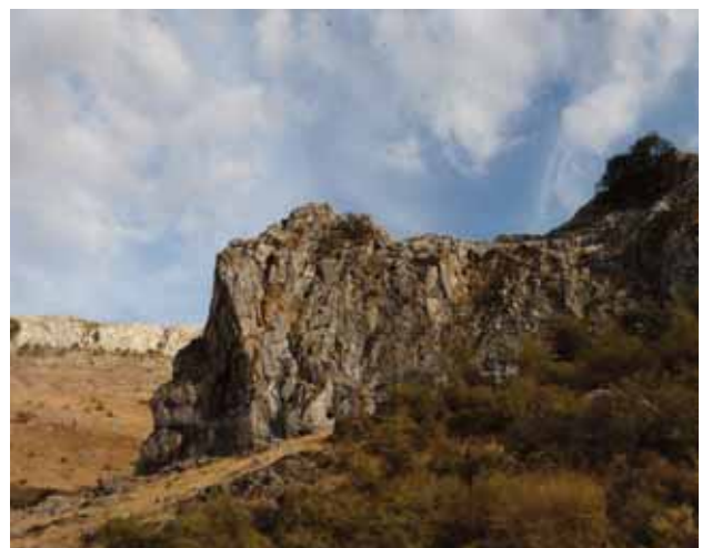
Spectacular limestone scenery between Malaga and Ronda