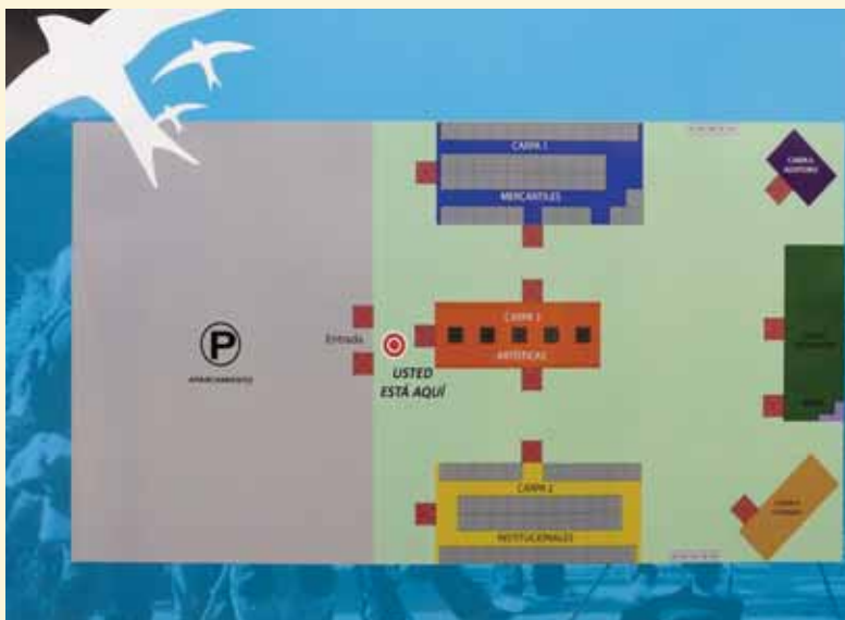
General plan of the 2008 Tarifa Bird Fair

flowers were gone there were interesting fruits, seeds and views.