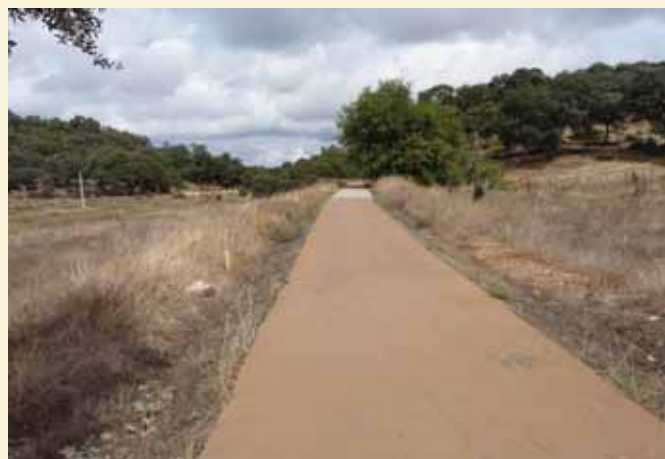
Disused railway converted to cycle path