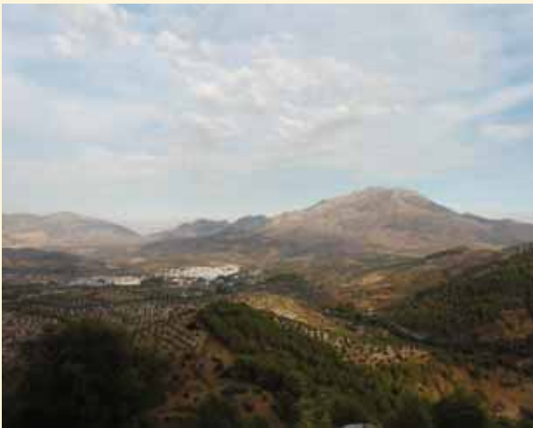
A view of the landscape with olive trees, mountains and small white towns

What does Andalucía have to offer? It has a great climate, national parks, mountains, small villages, friendly people, historic sites and a regional government that recognizes the value of its natural surroundings and wildlife as a tourist asset. If you prefer a beach holiday you will not be disappointed either with Malaga, Marbella and Manliva all close by on the coast.