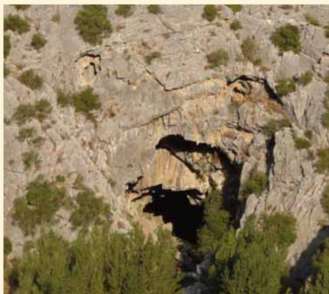
Cueva del Gato (Cave of the cat)

Our next call took us into the mountains along narrow roads with panoramic views. There was very little traffic and even fewer people. In the mountains we left the transport and walked along the narrow road, passing pigs and cattle grazing on the flat valley bottom. Holm-oak forests abound in this area where the pigs grow fat on the autumn acorns. This mountainous area was especially scenic with ever-changing vistas. It was rich in birdlife, with many smaller species such as warblers. En route we called at a country hotel that specialized in holidays for birdwatchers. The property was an old farm with