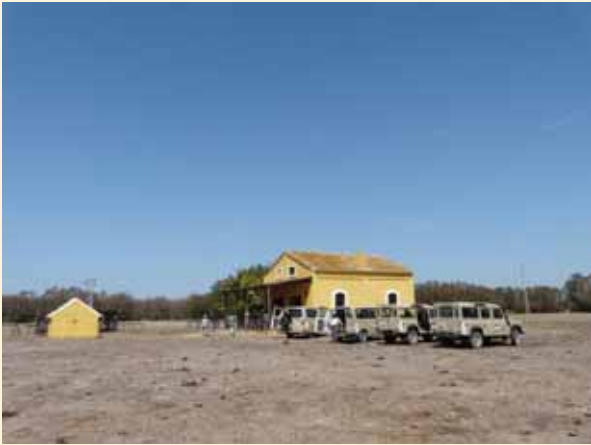
Donaña National Park - lunch stop

parched baked clay as the summer weather dries up the water. Some patches of water remain all the year round and at times these are simply teeming with birds. At one time the whole Donaña area was a vast delta of the Guadalquivir river, but over time this gradually filled with sediments and formed first a shallow lagoon and now marshes. The whole area is therefore very flat. Donaña national park is home to the Iberian Lynx, a shy predator that we hoped to see. Unfortunately this was not to be, but our guides reported that it had been seen on numerous occasions. We did find wild boars. Here, in the Donaña national park we observed the Spanish Imperial Eagle to the obvious delight of the whole party. After an open air lunch served close to a former royal palace and hunting lodge we moved to one of the remaining wetland areas close to the Donaña visitor centre. The centre itself is named after Antonio Valverde whose vision and foresight ensured that the area was not drained for agricultural use. En route we passed carrion that was attracting a large number of large bird species including Griffon Vultures that circled overhead on the thermals. As the season was well advanced there were not many wet areas. This meant that on the remaining water there were large numbers of different bird species, together with