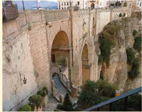
The 'new' bridge in Ronda

The journey for the author began in Southern Ireland,