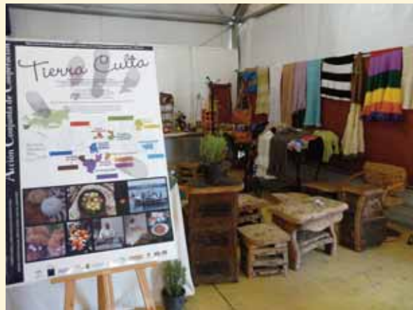
Craft items and cork products on show

Andalucía has large areas devoted to cork production, especially in the mountainous areas. The cork oak grows