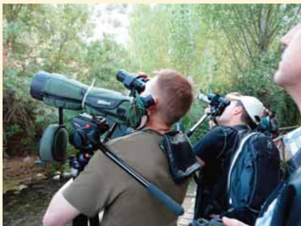
En route to Cueva del gato

many respects was in the same position as 3 or 4 others, of being a non-birding partner of a birdwatcher on holiday. As a keen nature photographer (landscape, trees, flowers and insects) the trip was a huge success. As far as birding goes it was a crash course in techniques, equipment and birds that resulted in a new interest and appreciation of this passion. The knowledge and enthusiasm of the experts was highly contagious.