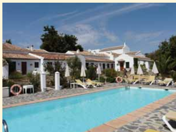
Country hotel, ensuite rooms with terraces set in farmland