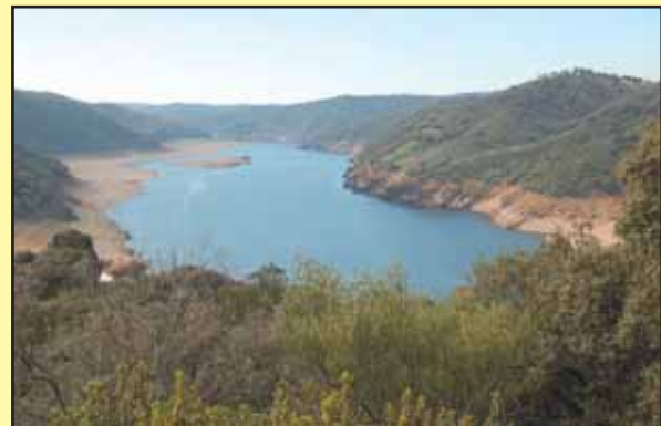
The gorge widens out showing the expanse of the river and the wooded slopes