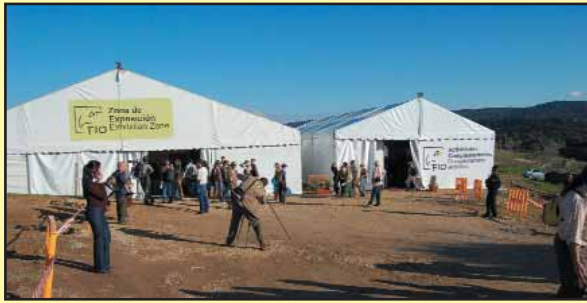
Two of the main marquees for trade stands

had lifted. We were especially fortunate to spot a sitting Griffon in a cleft on a rocky face, just a few metres from our vantage point on our side of the valley. Well camouflaged, but looking serene in close-up through a telescope lens - a rare opportunity to appreciate the beautiful feathers which fluttered in the gentle breeze. Also spotted, black storks, red kites, short-tailed eagle and a solitary Egyptian vulture.