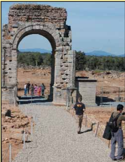
Part of the Roman ruins at Caparra which have been carefully preserved

A four-hour coach journey south from Madrid airport took us to the most southerly point of our trip, and an overnight stay at a four-star parador in the attractive town of Mérida, the regional capital. At the crack of dawn a stroll down to the Guadiana River to watch the early departure of egrets, herons and cormorants leaving their roosts was a most impressive sight. Following breakfast, a half-hour drive took us to the Canchales Reservoir, a favourite haunt for birders. The early morning mist soon lifted and gave us some excellent sightings of water-birds, including waders and herons. A flurry of swallows ducking and diving under a low bridge, left me wondering if they had just stopped off on their migrating journey to the UK; perhaps they knew that the English spring was going to be late again this year.