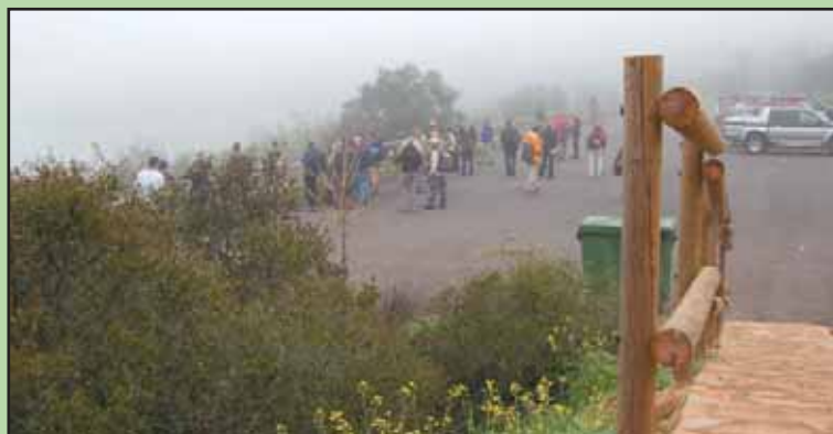
Birders wait for the early mornng mist to lift at Canchales Reservoir