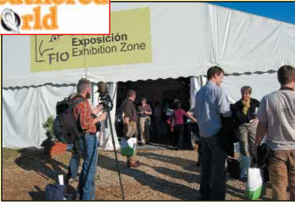
Busy scene at the entrance to one of the marquees