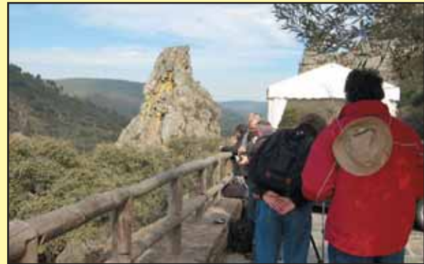
A roadside stop overlooking a Gorge near the famous Griffon colony