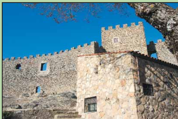
Montanchez castle giving scenic views over the Extremadura countryside