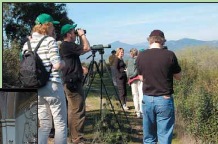
Above: The well-known Griffon Vulture colony in Monfrague National Park, and below, birders take in the spectacular scenery at one of the vantage points