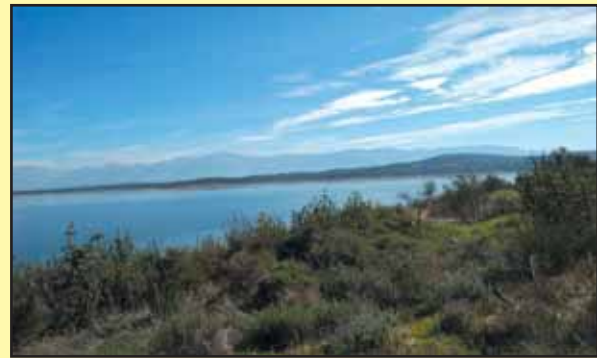
A view of the vast Reservoir of Ahidal, a good sight for water birds and other species