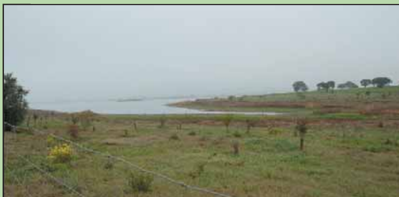
Canchales is a shallow lake excellent for spotting ducks, waders and herons