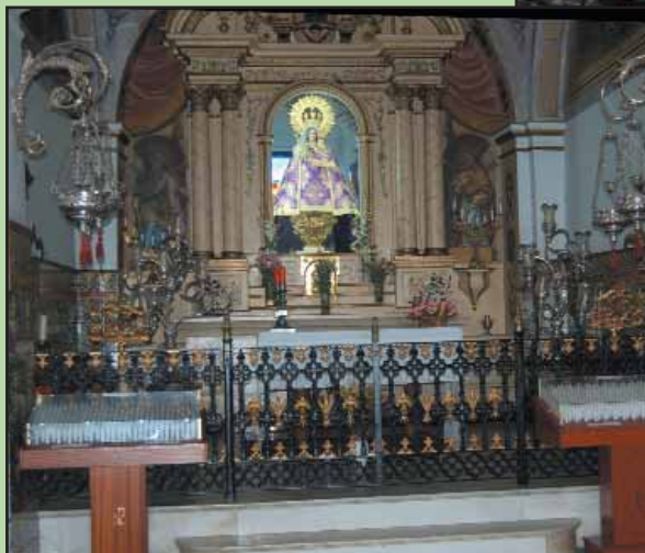
Left: The magnificent alter inside the church in the castle courtyard at Montanechez