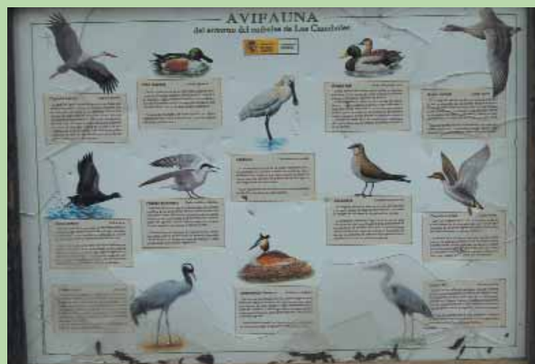
A helpful display board with a few of the birds located at Canchales Reservoir