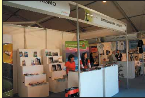
The official Extremadura at Fio